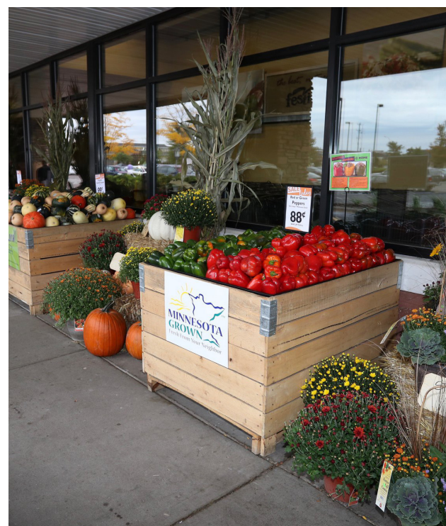
Clockwise from top right: Lunds & Byerlys, Chris's Food and Fuel Center, Festival Foods, Kowalski's